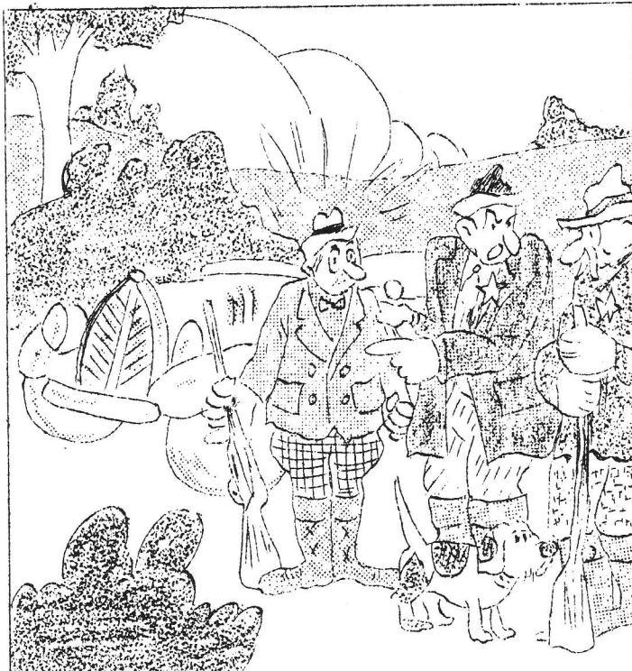
"Looks like a case for the G-men--no hunting license, no dog license, and no driver's license!" ....Kansas City Star.

in such numbers was looked upon heaven!"